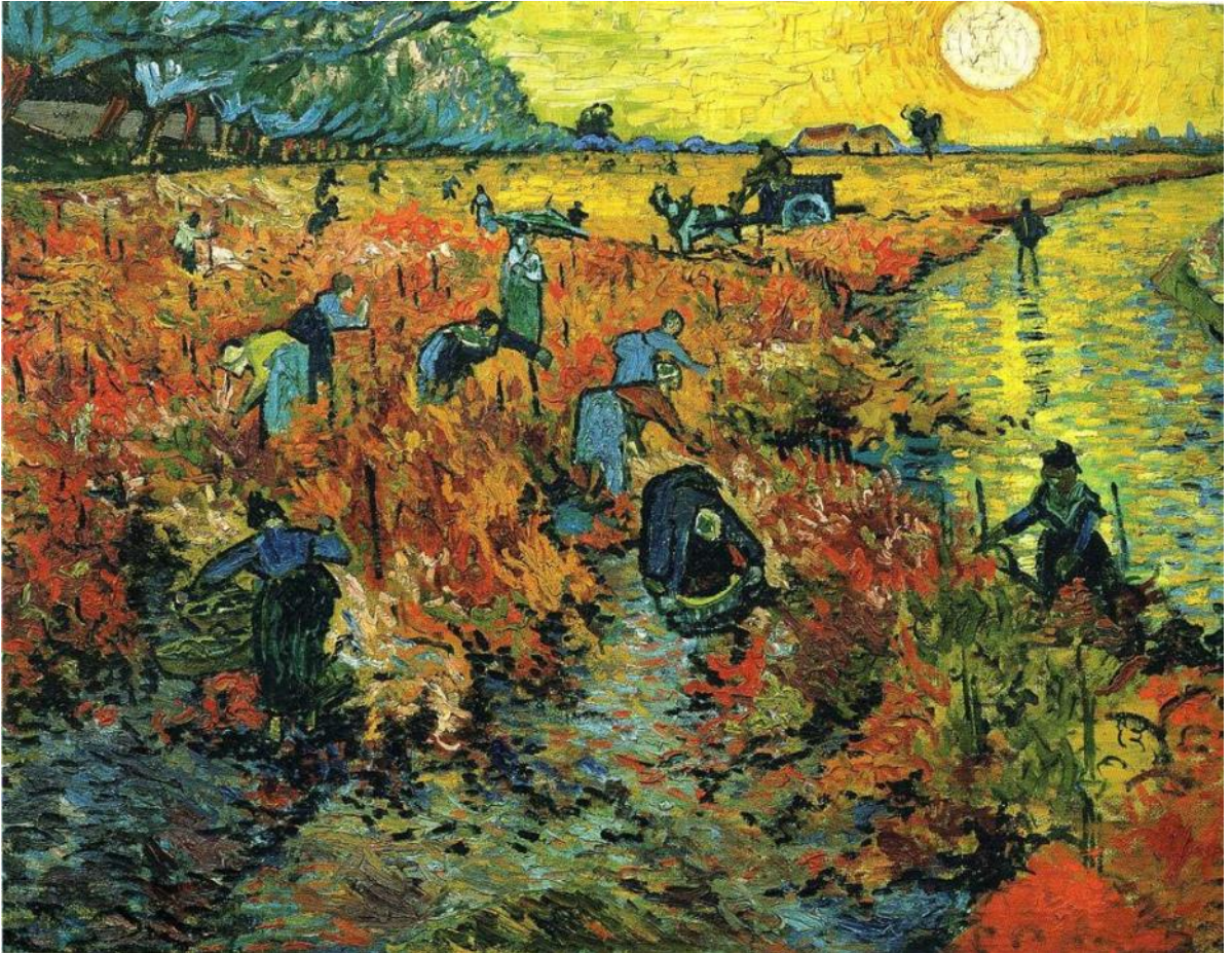
'Red Vineyards at Arles' (1888) by Vincent Van Gogh