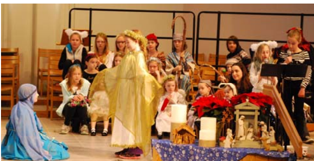
2017 Children's Christmas Pageant

Friday, February 9: Family Fun Night and Talent Show – Again, this is INTERGENERATIONAL! Come and eat dinner and share your talent with the Oak Grove family.